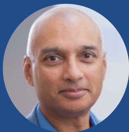
Deb Pal Biomedical Genetics, King's College London